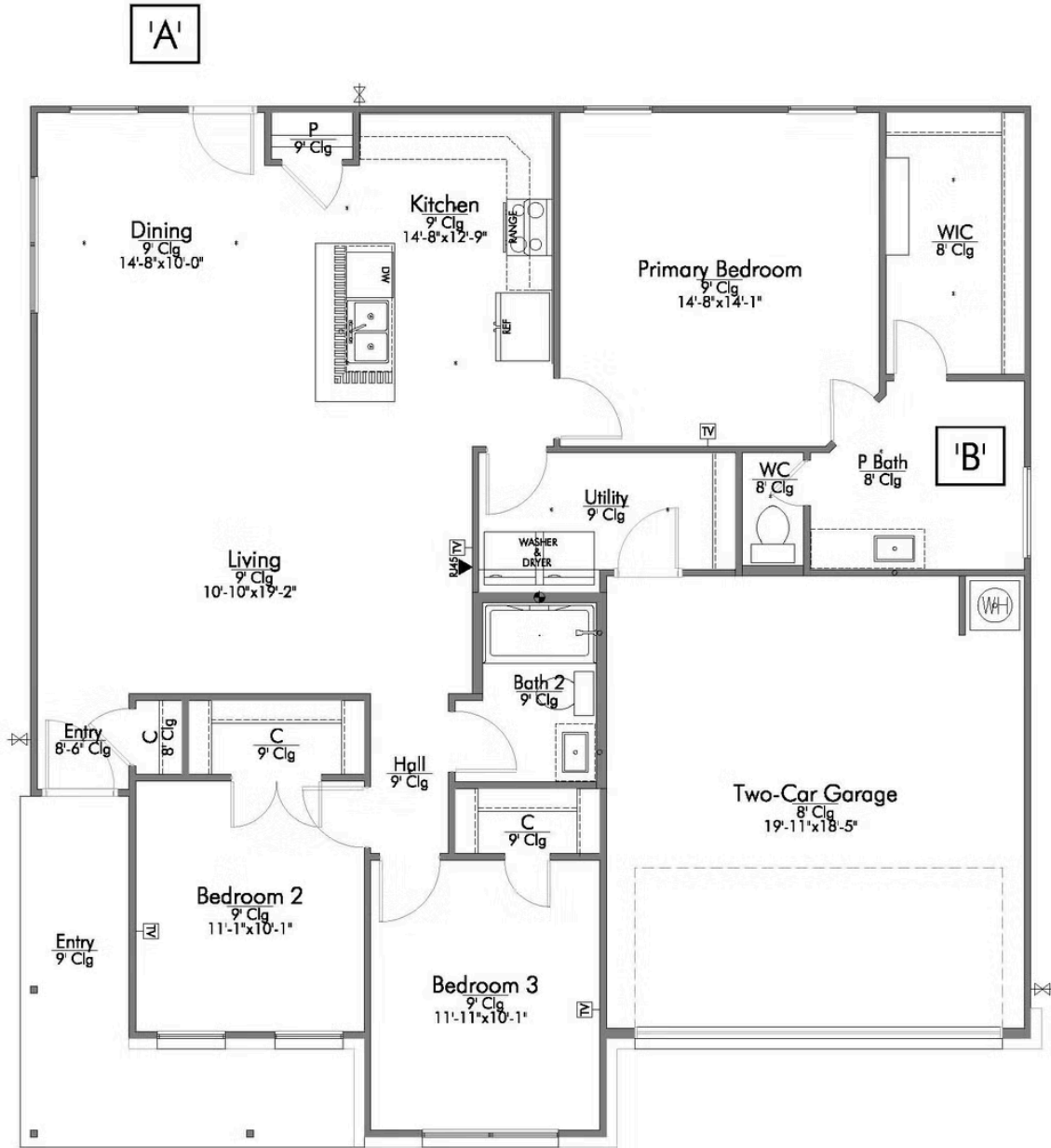
Building Envelope 45'-9" x 44'-11"