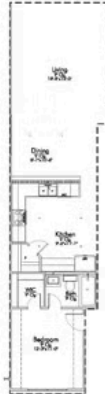
1.) BEDROOM SUITE