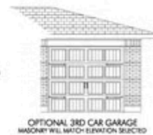
OPTIONAL 3RD CAR GARAGE MASONRY WILL MATCH ELEVATION SELECTED