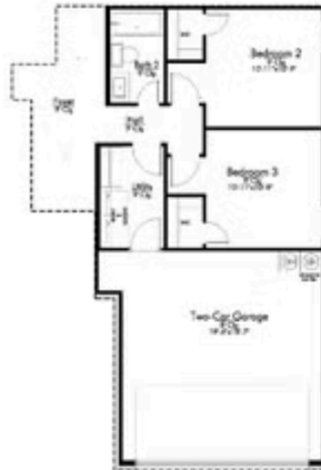
1.) 2 BR, 1 BA