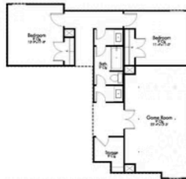
4.) 2 BEDROOMS W/ GAME ROOM