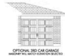
OPTIONAL 3RD CAR GARAGE MASONRY WILL MATCH ELEVATION SELECTED