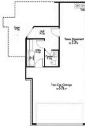
2.) TEXAS BASEMENT