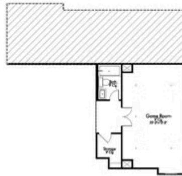
2.) GAME ROOM