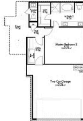
3.) ADDITIONAL BEDROOM SUITE