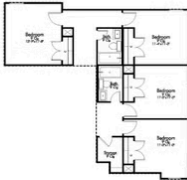
3.) FOUR BEDROOMS