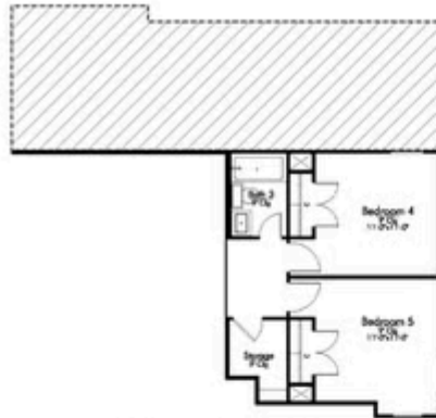
1.) 2 BEDROOMS, 1 BATH