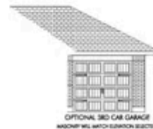
OPTIONAL 3RD CAR GARAGE WALK-IN MASTER BATH OPTION SELECTED