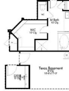
2.) TEXAS BASEMENT