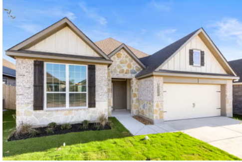
The 2082 Single Family Home Floor Plan