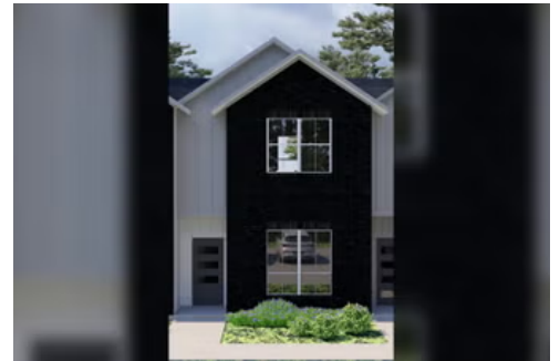
The 1048 - Midtown Townhome 6 Townhouse Home Floor Plan