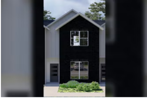
The 1048 - Midtown Townhome 7 Townhouse Home Floor Plan