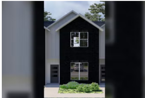
The 1048 - Midtown Townhome 5 Townhouse Home Floor Plan