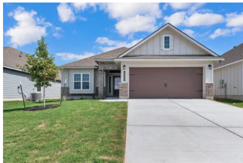
The 1613 Single Family Home Floor Plan