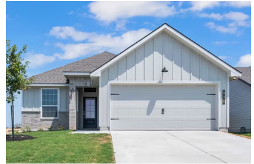
The 1443 Single Family Home Floor Plan