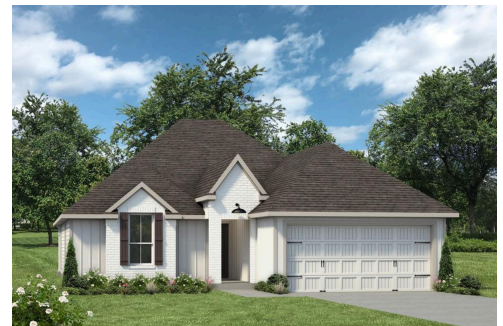
The 1651 Single Family Home Floor Plan