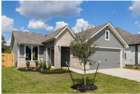
The 1262 Single Family Home Floor Plan