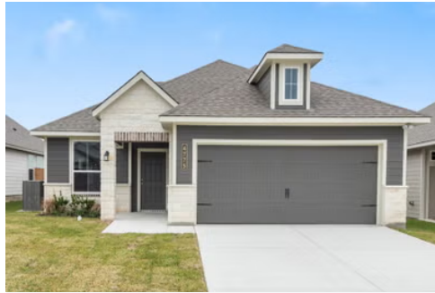
The 1363 Single Family Home Floor Plan