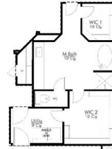
2.) MASTER BATH SUITE OPTION