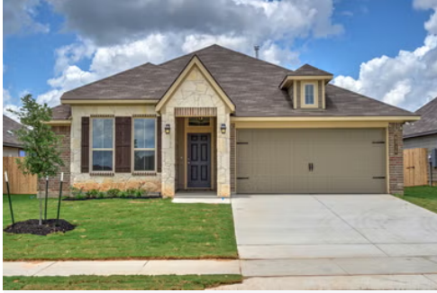
The 1514 Single Family Home Floor Plan