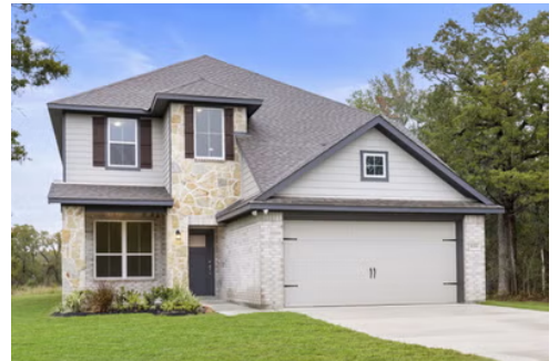
The 2516 Single Family Home Floor Plan