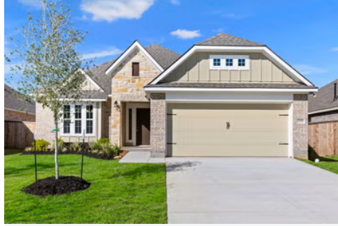
The 1613 Single Family Home Floor Plan