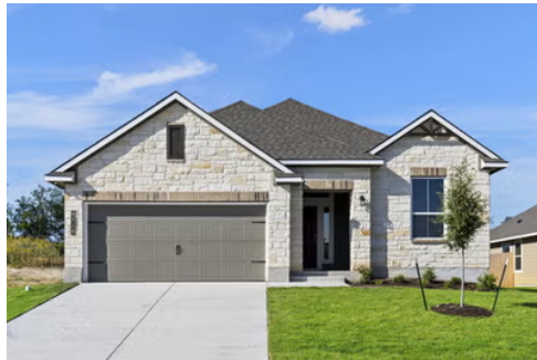
The 2082 Single Family Home Floor Plan