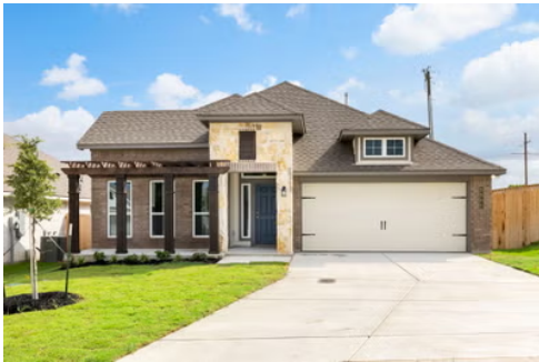
The 1818 Single Family Home Floor Plan