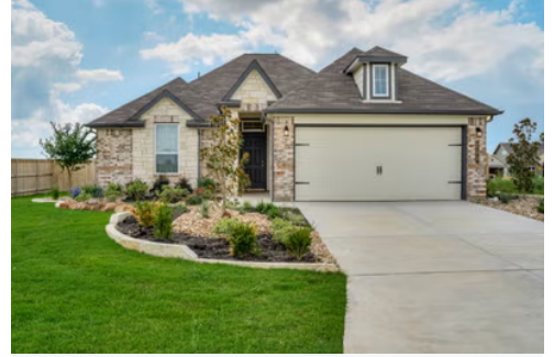
The 1651 Single Family Home Floor Plan