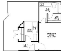
3.) BEDROOM SUITE

In continuous effort by Stylecraft Builders to improve the quality of your home, we reserve the right to change features, prices, plans and specifications without notice. Floorplans and elevation renderings are artists' conceptions only. Significant changes may be made during or after the construction of the model homes. Stylecraft Builders reserves the right to modify, relocate or eliminate any or all of the features, specifications, plan utilities, design or shape thereof, all without notice or obligations to any purchaser. Price range reflects base price only. Location premiums will be charged for certain locations and are not included in the base price of the home. Additional association fees may apply. Other fees may also apply. Amenities are proposed and planned or may be under construction. All square footages are approximate square footages of the total livable space. Water heater location deemed per city municipality code. Please see your onsite sales associate for additional information and more details. © 2024 Stylecraft Builders.