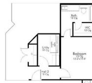
3.) BEDROOM SUITE

In continuous effort by Stylecraft Builders to improve the quality of your home, we reserve the right to change features, prices, plans and specifications without notice. Floorplans and elevation renderings are artists' conceptions only. Significant changes may be made during or after the construction of the model homes. Stylecraft Builders reserves the right to modify, relocate or eliminate any or all of the features, specifications, plan utilities, design or shape thereof, all without notice or obligations to any purchaser. Price range reflects base price only. Location premiums will be charged for certain locations and are not included in the base price of the home. Additional association fees may apply. Other fees may also apply. Amenities are proposed and planned or may be under construction. All square footages are approximate square footages of the total livable space. Water heater location deemed per city municipality code. Please see your onsite sales associate for additional information and more details. © 2024 Stylecraft Builders.