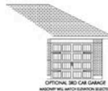
OPTIONAL 3RD CAR GARAGE MASSONRY WALL MATCH EXTERIOR SELECTED