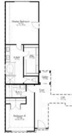
3.) BR SUITE OPTION