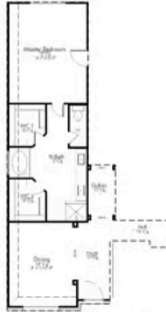
2.) DINING OPTION