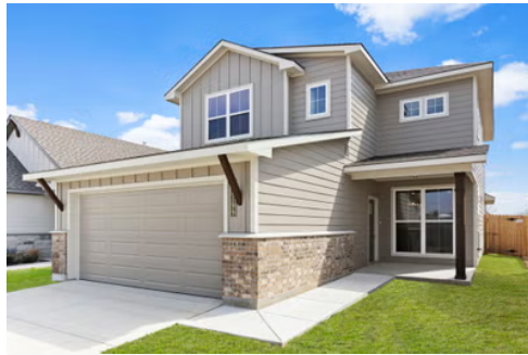
The 2341 Single Family Home Floor Plan