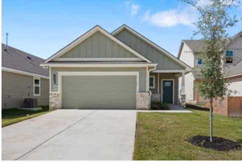
The 1419 Single Family Home Floor Plan