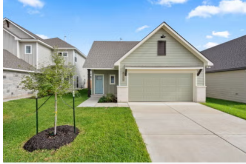
The 1497 Single Family Home Floor Plan