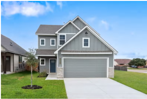
The 2029 Single Family Home Floor Plan