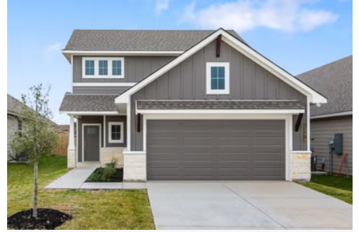
The 1953 Single Family Home Floor Plan