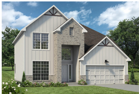
The 2588 Single Family Home Floor Plan