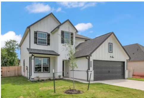
The 2516 Single Family Home Floor Plan