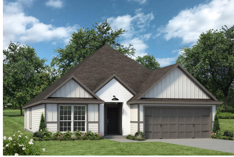
The 2082 Single Family Home Floor Plan