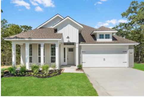
The 1818 Single Family Home Floor Plan