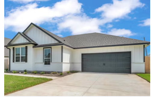
The 2205 Single Family Home Floor Plan