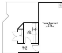
2.) TEXAS BASEMENT