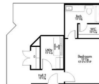
3.) BEDROOM SUITE

In continuous effort by Stylecraft Builders to improve the quality of your home, we reserve the right to change features, prices, plans and specifications without notice. Floorplans and elevation renderings are artists' conceptions only. Significant changes may be made during or after the construction of the model homes. Stylecraft Builders reserves the right to modify, relocate or eliminate any or all of the features, specifications, plan utilities, design or shape thereof, all without notice or obligations to any purchaser. Price range reflects base price only. Location premiums will be charged for certain locations and are not included in the base price of the home. Additional association fees may apply. Other fees may also apply. Amenities are proposed and planned or may be under construction. All square footages are approximate square footages of the total livable space. Water heater location deemed per city municipality code. Please see your onsite sales associate for additional information and more details. © 2024 Stylecraft Builders.