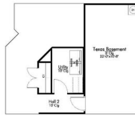
2.) TEXAS BASEMENT