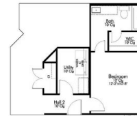
3.) BEDROOM SUITE