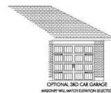
OPTIONAL 3RD CAR GARAGE W/ADDITIONAL STORAGE SPACE

(ONLY AVAILABLE WHEN THE STUDY OR DINING OPTION IS SELECTED)