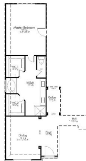
2.) DINING OPTION