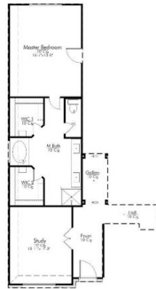
1.) STUDY OPTION

QUESTIONS? GET FAST ANSWERS 979-200-4552