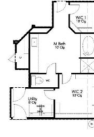
3.) MASTER BATH SUITE OPTION