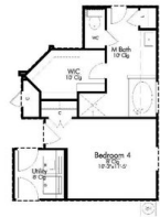
1.) ADDITIONAL BEDROOM SUITE

QUESTIONS? GET FAST ANSWERS 979-200-4552