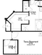
2.) TEXAS BASEMENT